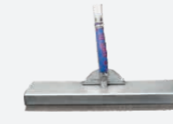
Brush with bristles