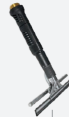
Window cleaner w/diffusor