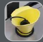
Detergent tank - 7,5 liters

Vacuum cleaner with float and drum capacity of: 7,5 L - Stainless steel | 5,5 L - Plastic