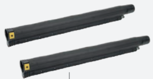
Extension tubes L. 480mm