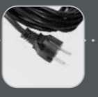
Electric plugs - 8m: