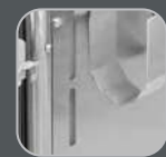
Detergent tank level indicator