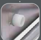
Water mains connection