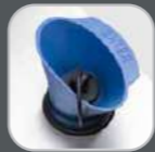
Water tank 7,5 liters