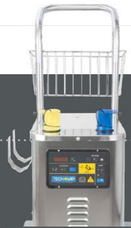
Version without vacuum cleaner