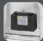
Steam outlet 6bar - 7P