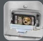
Steam outlet 10bar - 12P