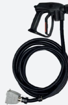
Steam hose 5m - 8m