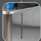
Water tank level indicator