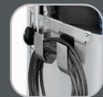
Cable holder & accessory basket