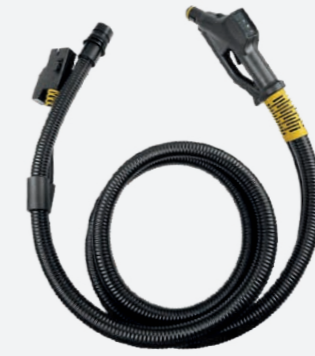
Impugnatura con pannello di comando 4m