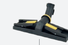
Floor tool L.300mm