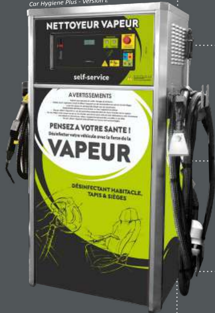
Car Hygiene Plus - Version E