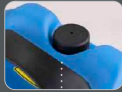
Water tank - 3 l