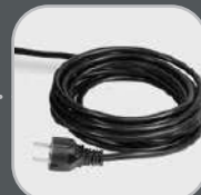
Electric plug SHUKO 5m