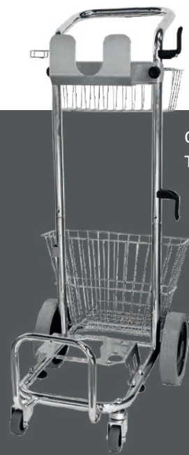
Optional Trolley ARENA PLUS