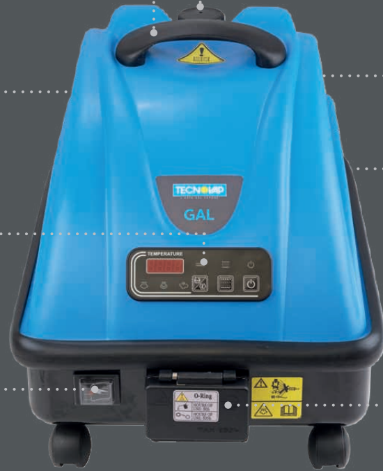
Plastic wheels 360°