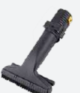
Upholstery tool with horse hair insert