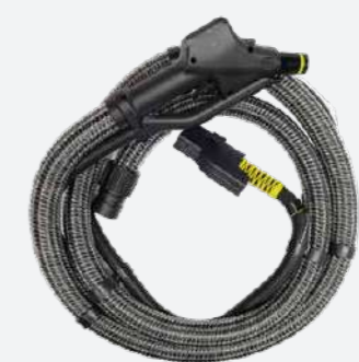
STAR hose with control panel 4m