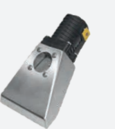
Stainless steel upholstery tool w/window