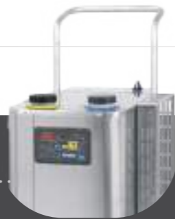
Version without vacuum cleaner