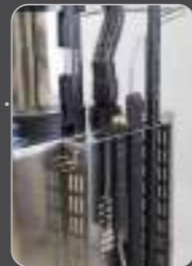
Accessory baskets, extension tube holder & water tank level indicator