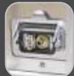
Steam outlet 10bar - 12P