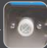
Water mains connection