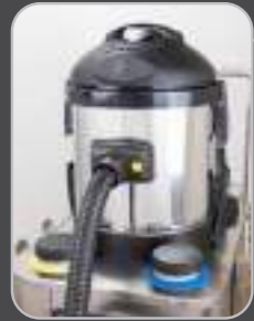
Vacuum cleaner with induction turbine and drum capacity of 7,5 l / 14 l