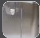
Detergent tank level indicator