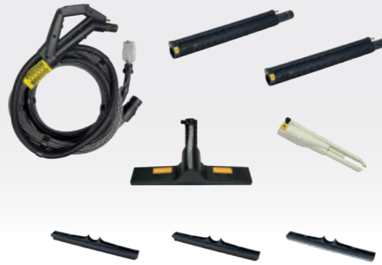
RADAMES 6bar - Steam & vacuum