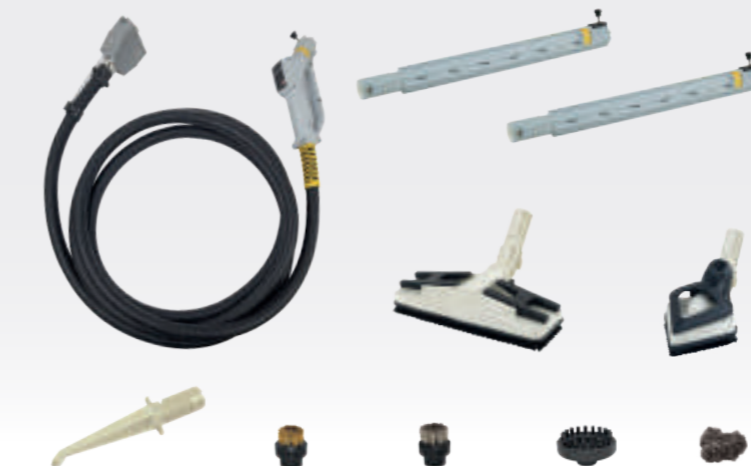
July 6bar - Steam