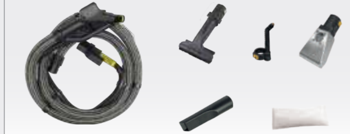
Star 6bar - Steam & vacuum